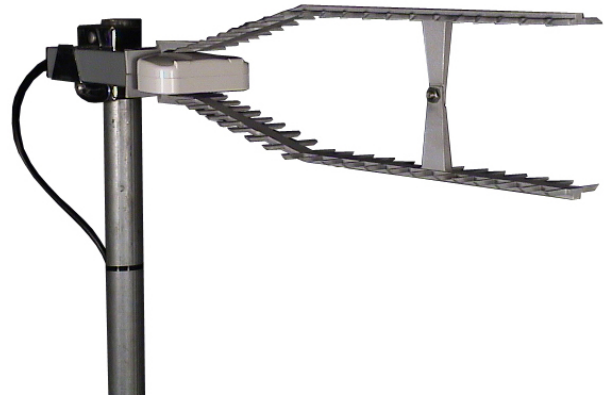
*16dBi Directional Vagi Antenna – Horizontal