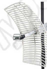
Tilt & Swivel Mast Mount