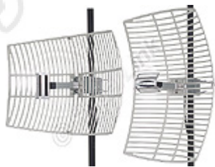
Vertical or Horizontal Polarization

The HG2419G WiFi antenna is supplied with a 60 degree tilt and swivel mast mount kit. This allows installation at various degrees of incline for easy alignment. It can be adjusted up or down from 0° to 60°.