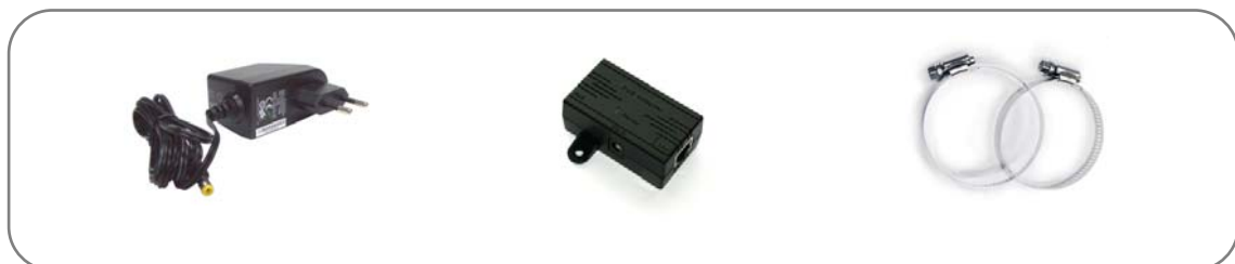
12V / 1A Power Adapter